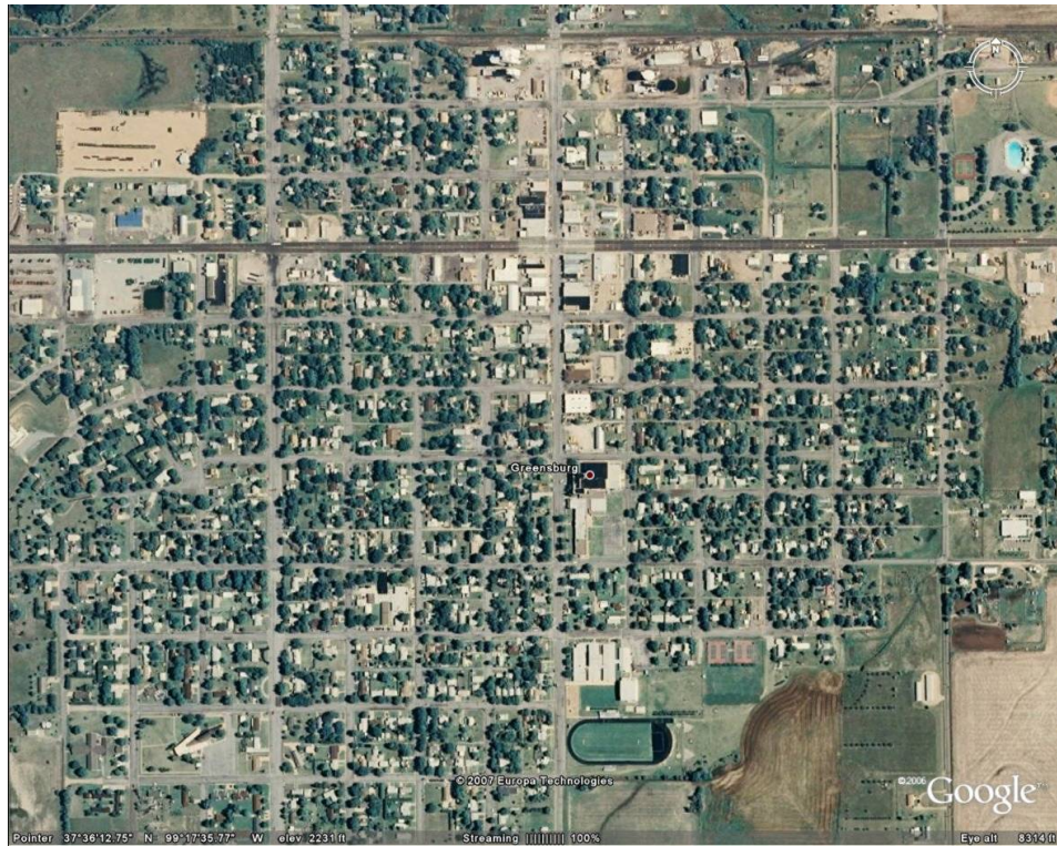
Greensburg, Kansas, from above before the tornado hit.