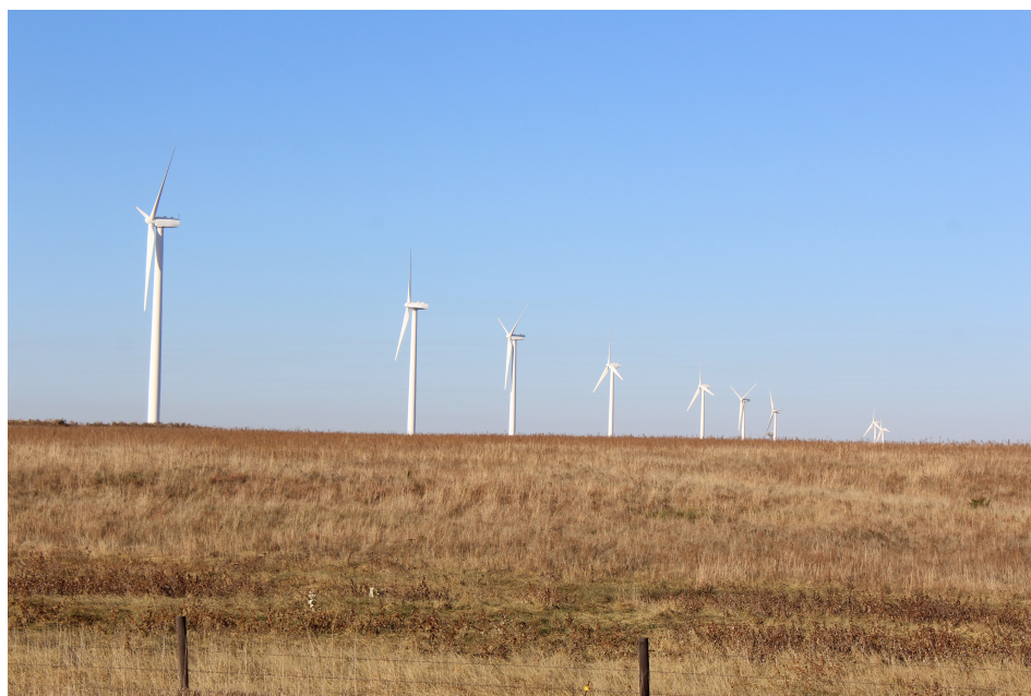
Greensburg's 10 turbines, at 1.25 MW each.

The city entered an agreement with the developers to site the wind. Greensburg consumes around one-fourth to one-third of that power at any given time, so the city is able to claim 100% renewables. The city gets the renewable energy credits and sells the excess power to the Kansas Power Pool, which has a peak load of 20% renewables. Energy costs are down $4,209 annually, according to DOE.